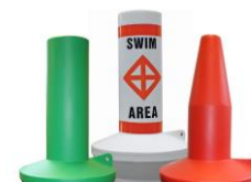
Buoy & Markers