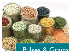
Pulses & Grains