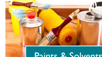
Paints & Solvents