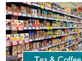
Tea & Coffee