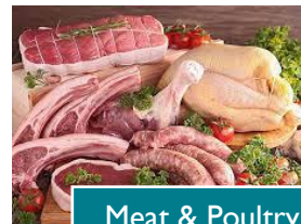
Meat & Poultry